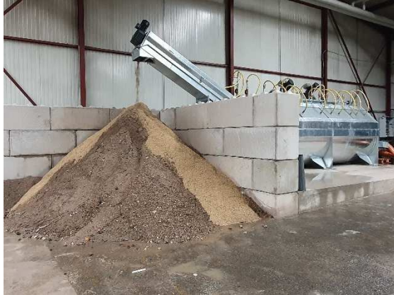
Materialbox with washed material

A second bucket elevator takes the washed material from the main washing chamber and feeds it to the spiral conveyor. The material is dewatered via this conveyor and transported into the material box.