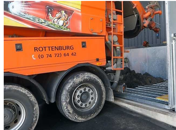
Material feed by sewer cleaning vehicle

The recycling system is fed on the one hand by emptying the company's own sewer cleaning vehicles and on the other hand by emptying waste skips.