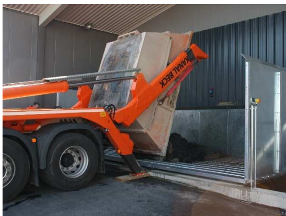
Material feed by waste skip

A hopper construction with a feed area of 7.4 m x 3.3 m and a buffer volume of approx. 9 m 3 serves as the feed bunker. The material is fed into the recycling system via a duplex screw conveyor with a screw diameter of 600 mm and a conveying capacity of 12 m 3 /h each.